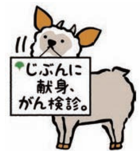
Moshikamo-kun Character for cancer screening promotion

The TMG promotes measures to prevent cancer based on the Tokyo Metropolitan Health Promotion Plan 21 (Phase 2) and the Tokyo Metropolitan Plan to Promote Cancer Control Programs (Phase 2 revision) (Plan period: FY2018 to FY2023), which is the comprehensive plan that covers from cancer prevention to treatment and attaining a higher quality of recuperation.